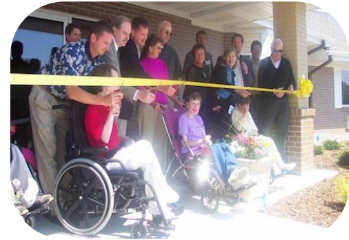
Harbor House welcomes its first families in 2004

I think of the first families who gathered on the front porch as they cut the ribbon on our first home—Pier Place. Their stories are bittersweet. While they were excited for their son/daughter to have a new community with more people to love and to learn from, they also said it was hard to let go and trust others. The same has been true for each new housemate who moves into Harbor House.