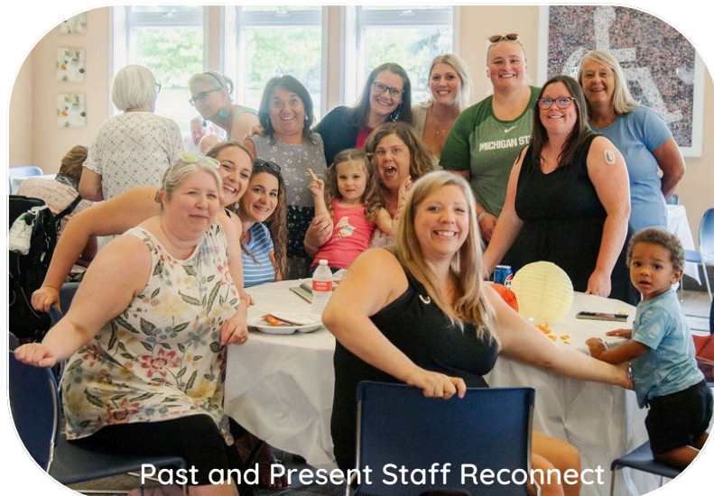
Past and Present Staff Reconnect

“We had forgotten how wonderful it is to gather with our extended family! Thanks for the chance to reconnect.”