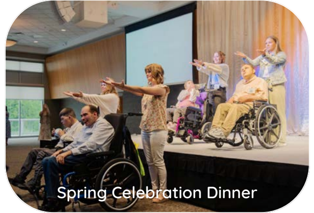
Spring Celebration Dinner