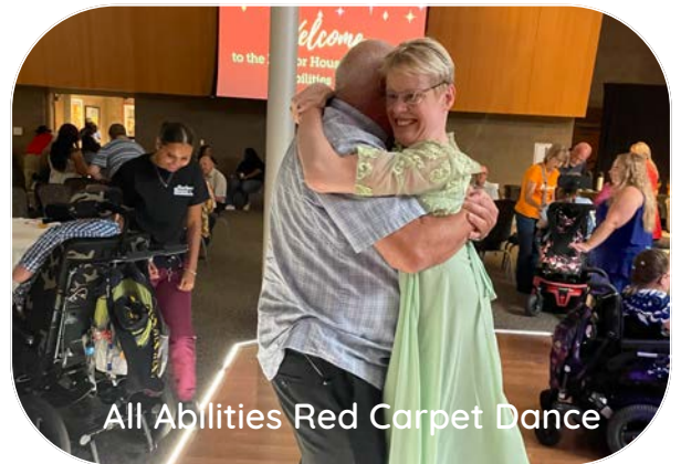
All Abilities Red Carpet Dance