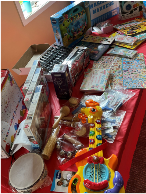
Christmas in July