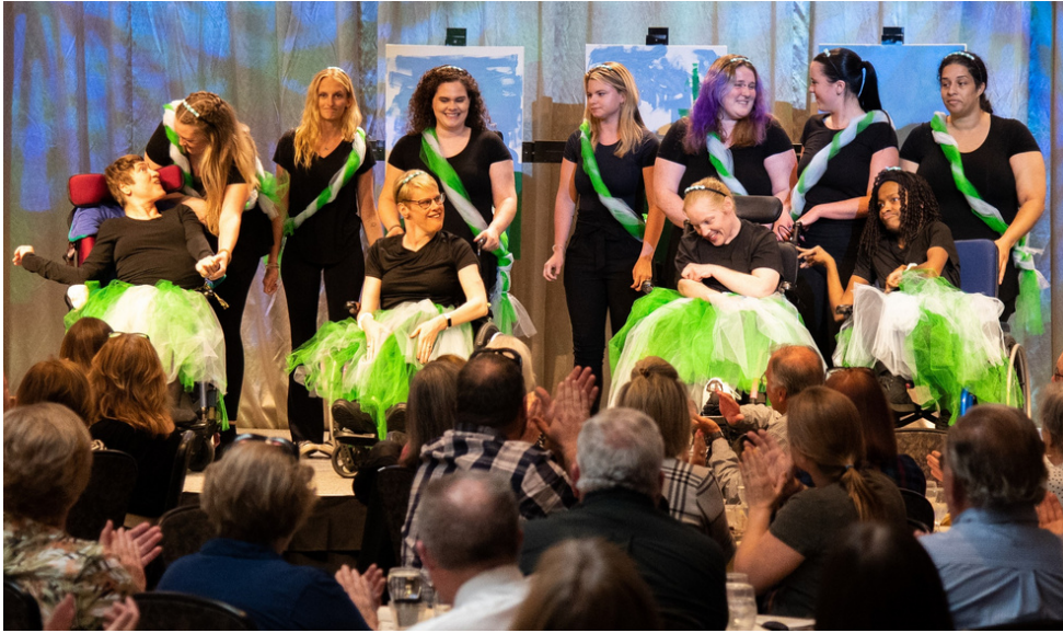
Celebration Dinner - Made to Worship!

Because of YOU, every day has been a celebration of an enriched, abundant life!