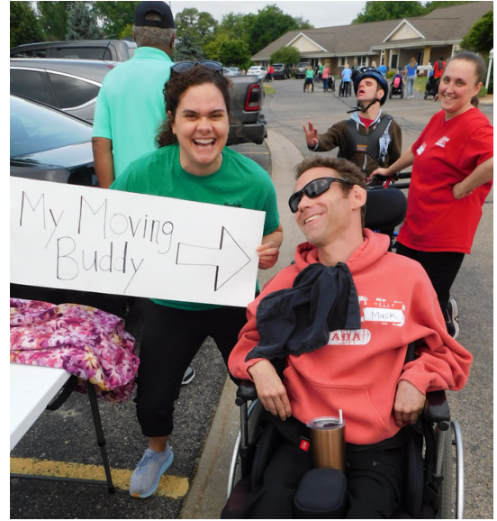
Move-a-Thon - "Ready, Set, Go!"