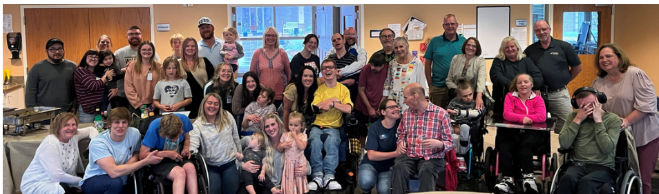
Staff and Family Dinners

"The friendships and relationships that happen here go way beyond a to-do list...HHM is like my second family. We are blessed beyond measure to be here everyday."