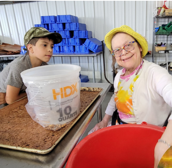
A resident volunteers at Sus Manos