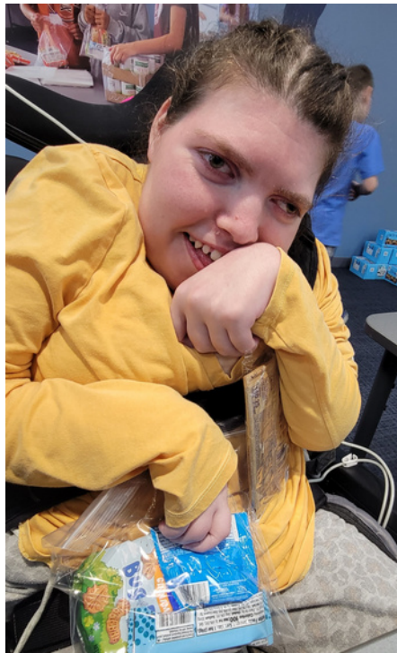
Volunteering - Hand-to-Hand