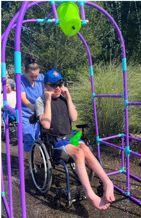
Beating the Heat - Sprinklers